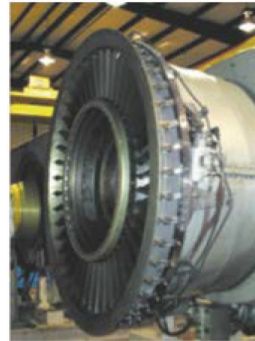
Variable Inlet Guide Vanes Assembly