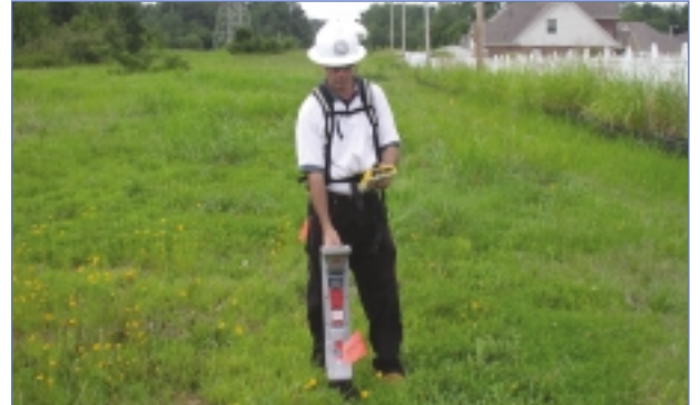
Collecting indirect inspection information.