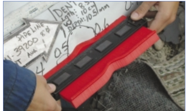
GE Energy's ECDA services can help lower excavation costs and prolong asset life.