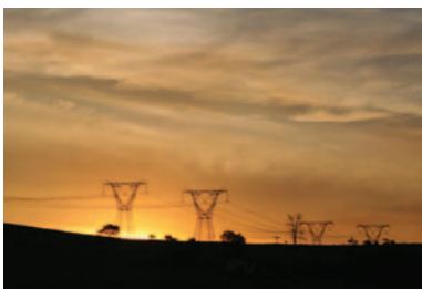
In 2005, 81 nuclear power plants based on GE's BWR technology had a capacity of nearly 74,000 MW of electricity.

For 50 years, GE has provided advanced technology for nuclear energy. GE developed breakthrough light water technology in the mid-1950s: the Boiling Water Reactor (BWR). Since then, GE has developed nine evolutions of BWR technology, including the first operational Generation III Class advanced light water design in the world—the ABWR—and culminating in its latest Generation III+ Class design—the ESBWR—which incorporates advanced safety features, improved economics and new operational efficiencies.