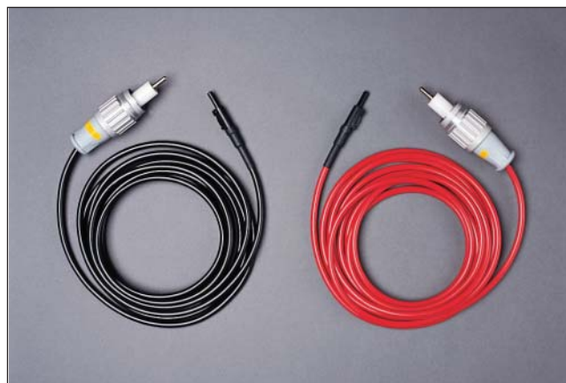
Cable set GA-00090