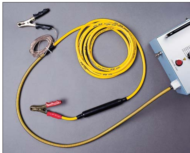
Permanently mounted cable set and ground cable.