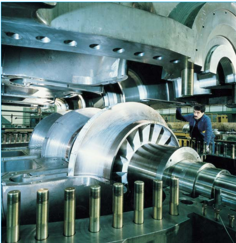
Large horizontally split compressor

Tilting-pad journal bearings: this type of bearing improves the dynamic performance of the rotor and drastically reduces instability phenomena induced by lubricating oil. These bearings demonstrate lower spare parts cost, since only the tilting pads and not the bearing housing need to be changed. This system also allows better temperature monitoring, because the tilting pads can be easily equipped with thermocouples. Benefits include reduced lubrication, reduced parasitic power losses and lower bearing temperatures.