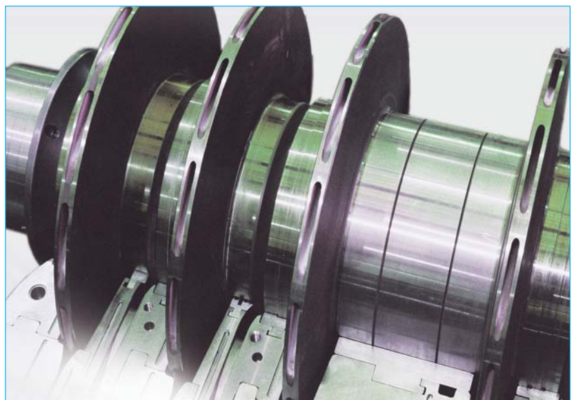
Compressor rotor details